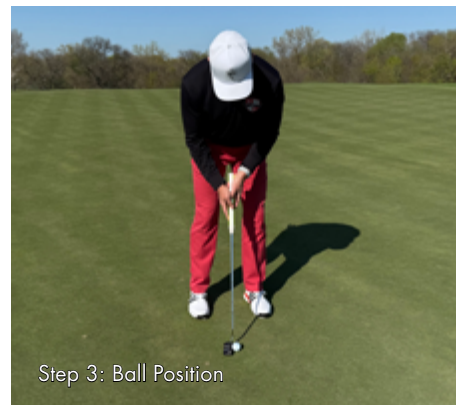
Step 3: Ball Position