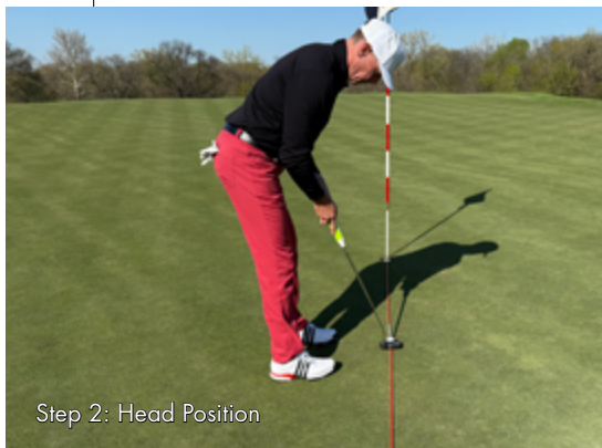
Step 2: Head Position