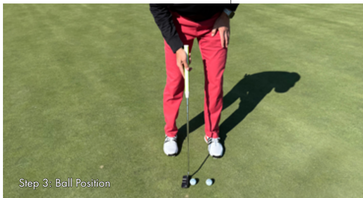
Step 3: Ball Position